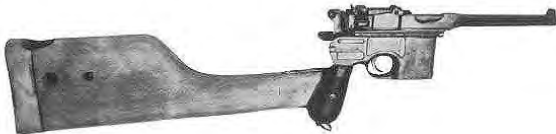
1932 variant Mauser C96 fitted with shoulder stock for use as a carbine

The C96 Mauser is a semiautomatic pistol with a 10 round magazine capacity. However, a later 1932 variant of the Mauser could be attached to a wooden stock and used as a carbine. This variant also featured the lighter 7.63mm round, sacrificing potential damage for a slightly higher rate of fire. The safety catch for the pistol is to the left rear above the trigger guard. The bullet magazine is inserted forward of the trigger guard with 20 round magazines used only when the weapon is employed as a carbine.