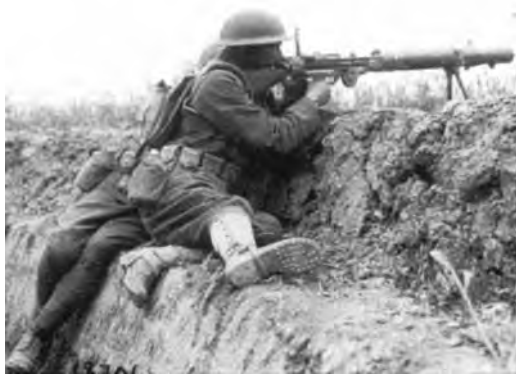
Lewis gunner in action

American soldiers first used the .303 British caliber Lewis gun on the Mexican border in 1916. Bowing to public pressure built upon more than two years of combat success in Europe, Colonel Lewis's own army finally adopted the .303-'06 caliber Lewis machine gun, to be called the Model 1917 manufactured by Savage Arms Co.